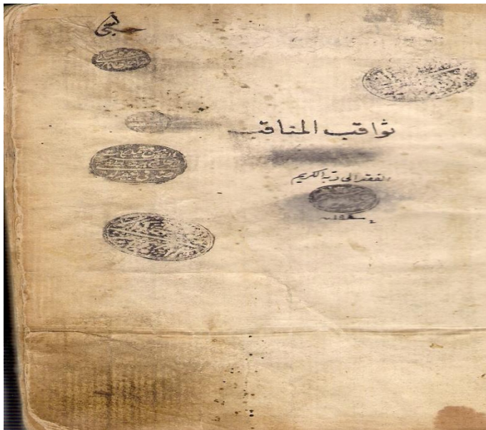
The first page of a manuscript showing seals of various persons and contents

In these sections a total of 525 titles have been introduced. Second section belongs to “codicology”.